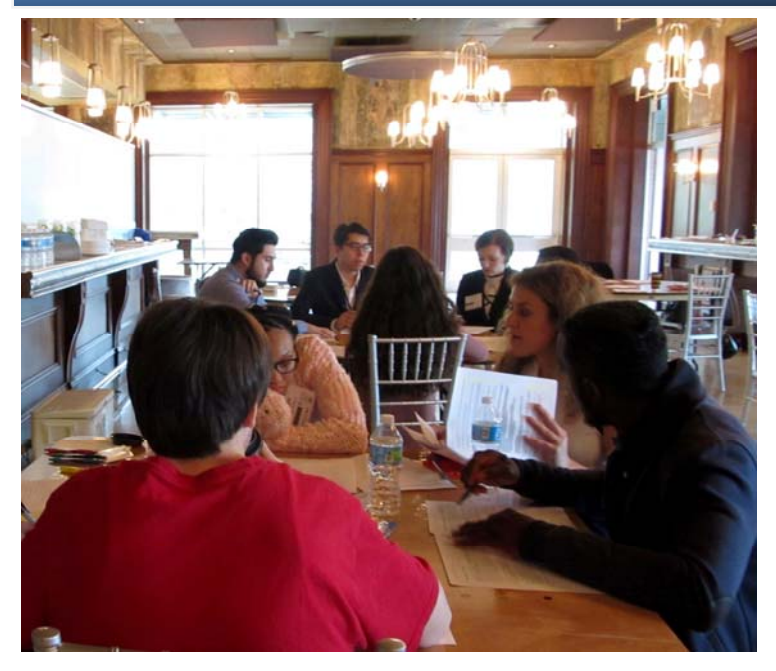
High school students discussing legal issues

The Charleston County Bar Association, along with Nelson Mullins Riley & Scarborough LLP, sponsored the Street Law program in April and May in which Charleston Bar lawyers attended a training and planning session, and two teams of lawyers then taught lessons in contracts and sexual harassment to Stall High School students in North Charleston. The classroom visits were followed by a field trip to Harborside East, where the high school students met with Charleston Bar lawyers and students from the Charleston School of Law, where they applied the lessons learned in class by conducting mock negotiations and litigation exercises.