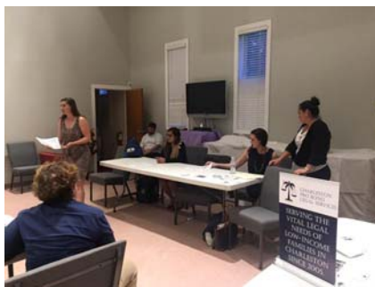
Volunteer Attorneys at Immigration Seminar

Charleston Pro Bono provides educational seminars on topics such as bankruptcy, expungements, and family law. We also host direct service clinics where volunteer attorneys provide advice and counsel, and also help prepare documents. In the first quarter of this year, we evaluated existing outreach programs and worked on establishing new partnerships. Below is a brief list of our new outreach initiatives and how you as a Charleston County Bar Association member can get involved.